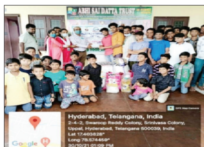
Donation of Food and Money to Abhi Sai Datta Trust, Uppal, Hyderabad.

Malaria remains a primary cause of childhood illness and death in sub-Saharan Africa. More than 2,60,000 African children under the age of five die from malaria annually. WHO recommended RTS,S malaria vaccine to be used for the prevention of malaria caused by of P. falciparum in children living in regions with moderate to high transmission. RTS,S malaria vaccine should be provided in a schedule of 4 doses in children from 5 months of age.