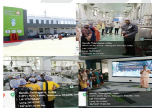
Visit to Akshaya Patra Foundation.