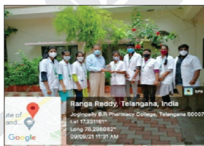
Distribution of "Eco Ganesh Pratima" on occasion of Ganesh Chaturthi.