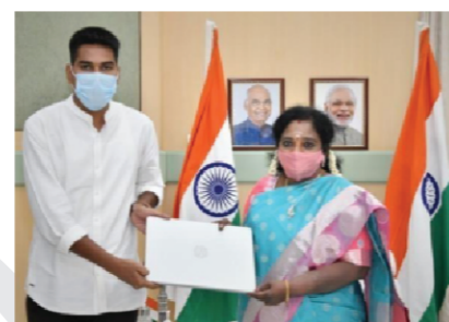
Her Excellency, Dr. Tamilasai Soundararajan, Telangana Governor Presented a Laptop to our student.